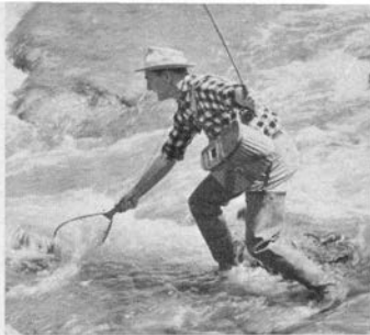
An excellent "catch!" Everything excluded but one simple story.

You'll get the best results on bright, sunny days in mid-morning or mid-afternoon with both black-and-white and color film. Scenic color shots can be time-exposed when the sun is low, and are often more beautiful because of striking dawn or sunset colors. Try them when you can count on everything to stand still—including your camera. Use a steady support.